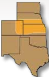
Area of Primary Adaptation